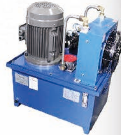
HYDRAULIC POWER UNIT