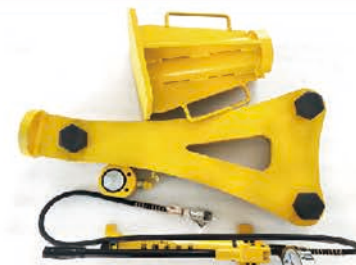
BRAKE TEST KIT