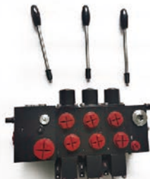
MULTIPLE CONTROL VALVE