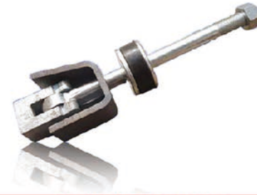
QUICK ACTING CLEAT